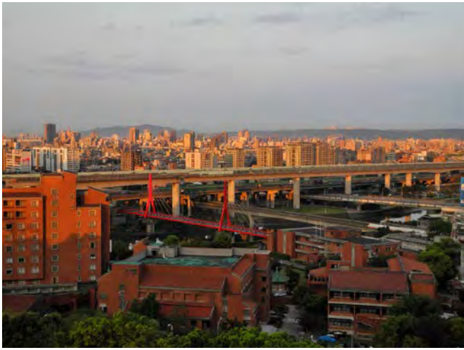
These pictures are of our view at sunrise and at night.