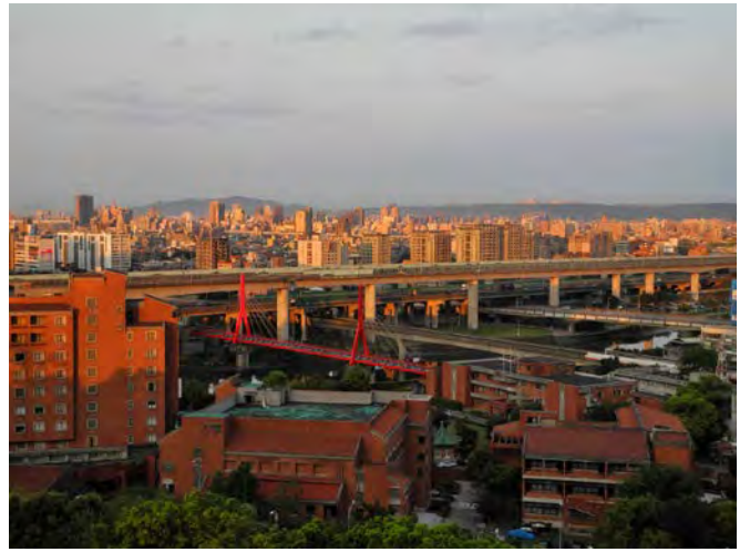
These pictures are of our view at sunrise and at night.